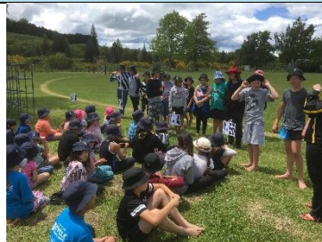
Whole School - Daily Athletics