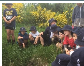
Room 3 & 4 - Exploration Adventures