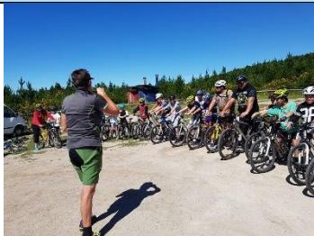
River Trail & Craters of the Lake